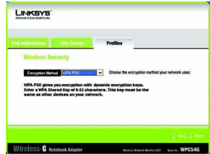
Figure 6-15: WPA-PSK Settings

WPA-PSK offers the TKIP encryption method with dynamic encryption keys. Click Next to continue or Back to return to the previous screen.